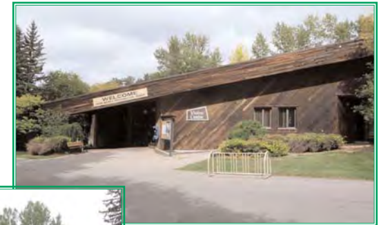
Bow Valley Ranch Visitor Centre

The Bow Valley Ranch Visitor Centre and surrounding asphalt pathways are wheelchair accessible.