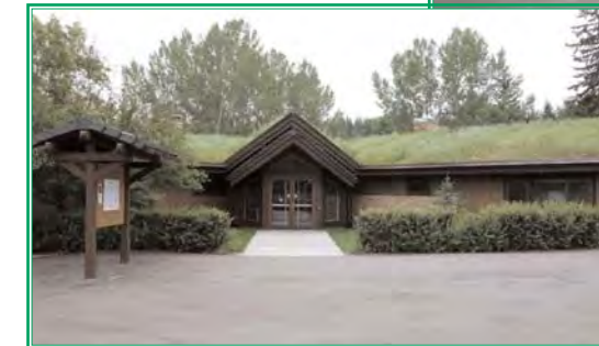
Fish Creek Environmental Learning Centre

With recent enhancements the FCELC has increased classroom size and functionality, audio-visual upgrades, larger public presentation space, and reduced ecological footprint. The building models an example of environmental sustainability with innovative materials, design, mechanical, and structural engineering.