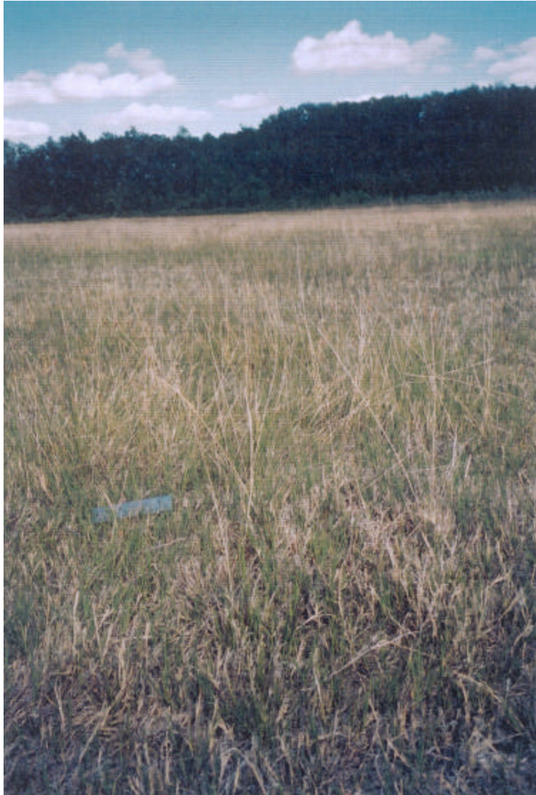
Photo: Carex parryana (Parry's sedge) plant detail: vigorous growth in drawdown lake meadow (Cp11—Carepar-020710c - D15)