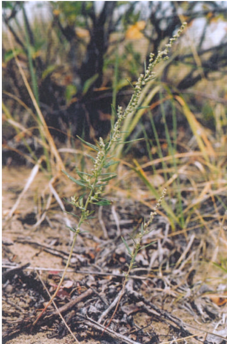
Photo: Chenopodium leptophyllum (narrow-leaved goosefoot) plant detail: growth habit and inflorescence (CI1 - Chenlep-020816b - O6)