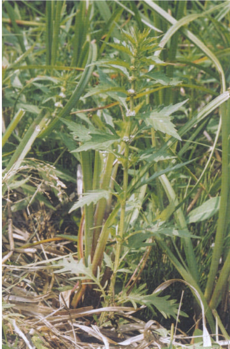
Photo: Lycopus americanus (American water-horehound) detail of plant growth habit (La17—Lycoame-020719d - J2)