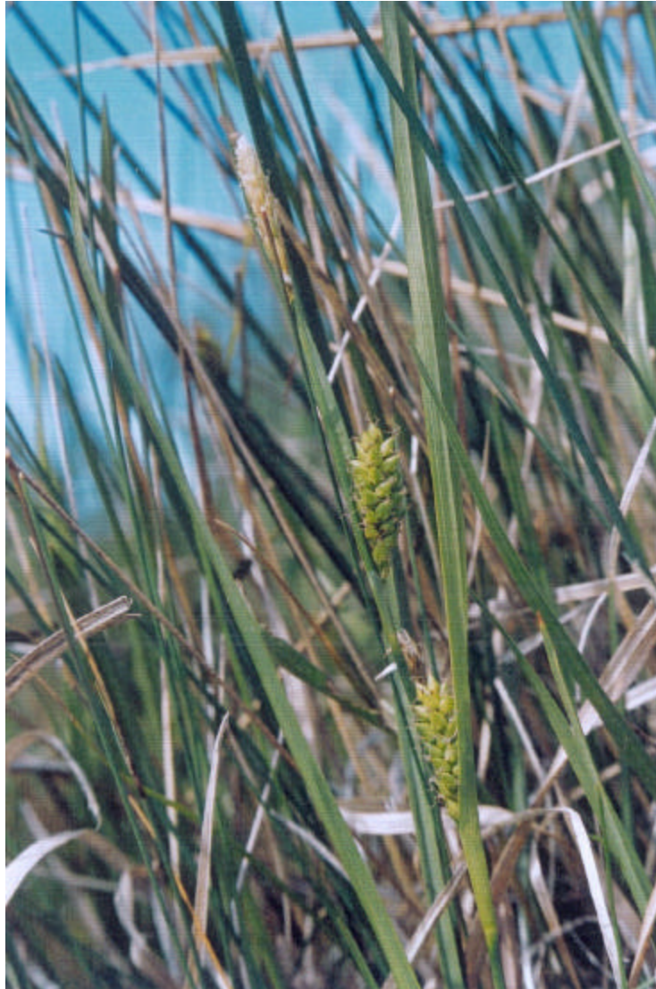
Photo: Carex crawei (Crawe's sedge) plant detail: inflorescence with young perigynia (Cc5—Carecra-020711b - E11)