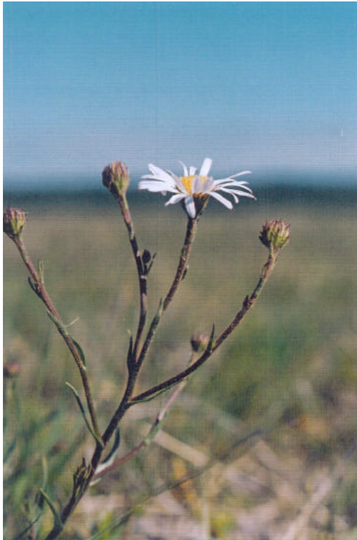
Photo: Aster pauciflorus (few-flowered aster) plant detail: inflorescence and flower (Ap3—Astepau-020815a - O23)