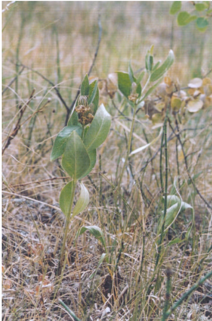
Photo: Asclepias ovalifolia (low milkweed) plant detail with flowering inflorescence (Ao7—Asclova-020714b - E22)