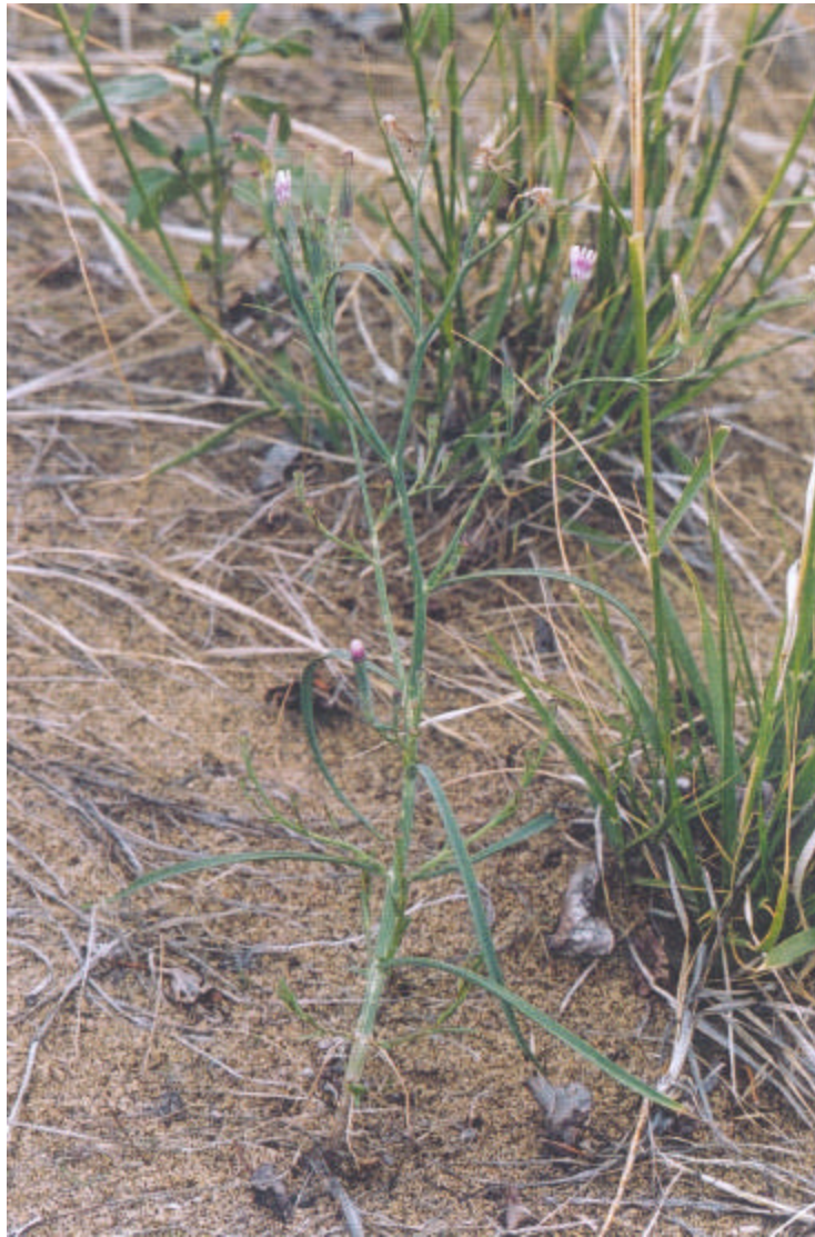
Photo: Shinneroseris rostrata (annual skeletonweed) plant detail: growth habit with flowering inflorescence (Sr17—Shinros-020816b—O8)