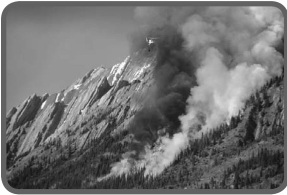
▲ Mt. Nestor Prescribed Fire 2008